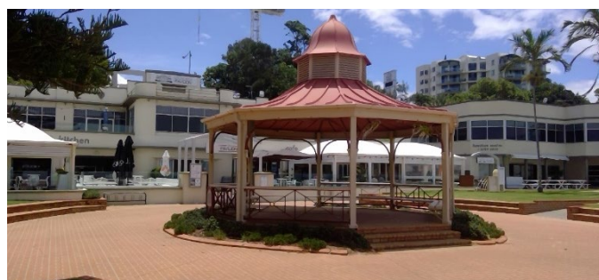
Picture: Suttons Beach Rotunda

Most participants (55%) indicated they have strong feelings about the rotunda. Participants from across the region identified that following attributes of the rotunda are important: its architecture, it is an icon of the area, it is a great stage for smaller cultural performances, it is a beautiful place to host events, it provides a great backdrop for photographs, and it is accessible to everyone.