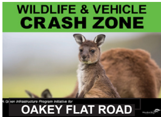
MBRC Kangaroo Sign

Wildlife warning signs and road stencils are common mitigation measures deployed to increase driver awareness of wildlife on roads.