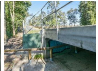
Fauna underpass - Warner