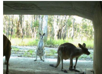
Fauna underpass - North Lakes

Fauna underpasses are structures that allow wildlife to cross under human-made barriers safely.