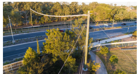
Fauna rope bridge

Fauna rope bridges are installed to connect canopy habitat and are particularly critical where exclusion fencing has removed other crossing opportunities.