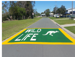
MBRC Pavement Stencil