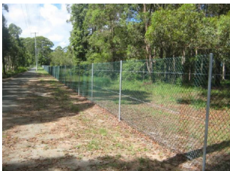
Kangaroo Exclusion Fencing

Fences can be implemented to prevent wildlife from accessing roads and funnel animals towards crossing structures.