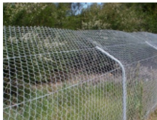
Floppy Top Fencing