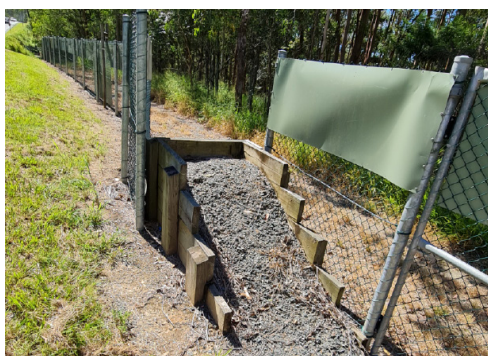
Kangaroo 'jump out ramp'

The 'jump out ramp' is designed to allow kangaroos trapped on the road side of the fence to escape back to safety and prevents the animal from re-entering the road corridor.