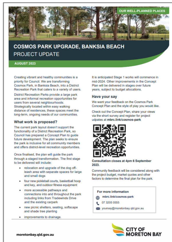
Cosmos Park project update

The purpose of these meetings was for officers to give an overview of the Concept Plan and provide the Clubs with the opportunity to clarify aspects of it before making their submissions via the online survey.